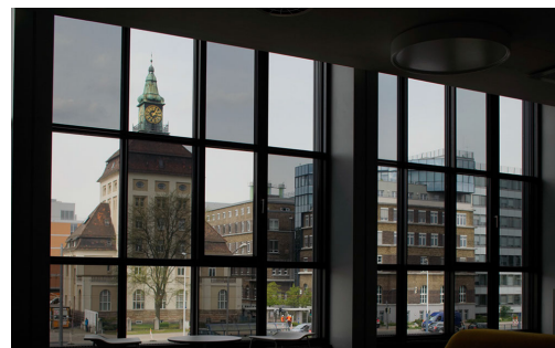
Liquid-crystal window by MERCK

Five talks by Task 56 partners were given in a dedicated session at the 11 th Conference on Advanced Building Skins, on on-going projects followed by discussions with experts from the multifunctional envelopes sector worldwide.