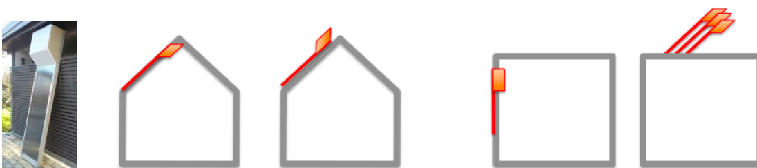
Figure 3: Different installation and integration options for the AventaSolar TSS concept.

Several basic installation modes are targeted with the present design: For roof or façade integration with the storage tank on the back side of the system, a roof top or free standing installation with the storage tank on the top side or behind of the absorber surface as illustrated in Figure 3.